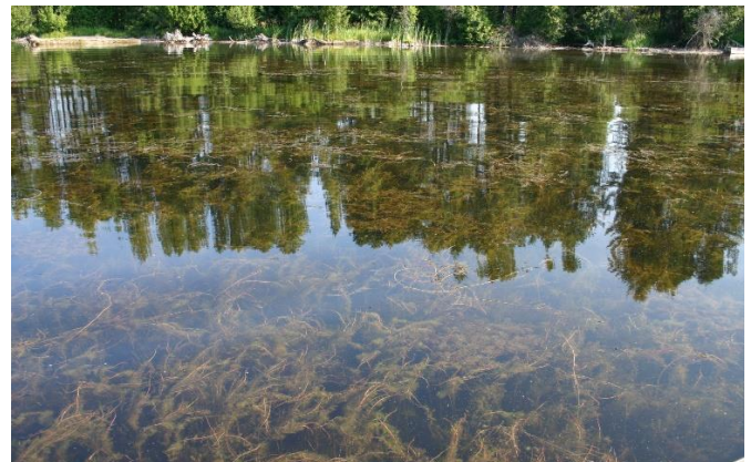
Brazilian Elodea ( Egeria )